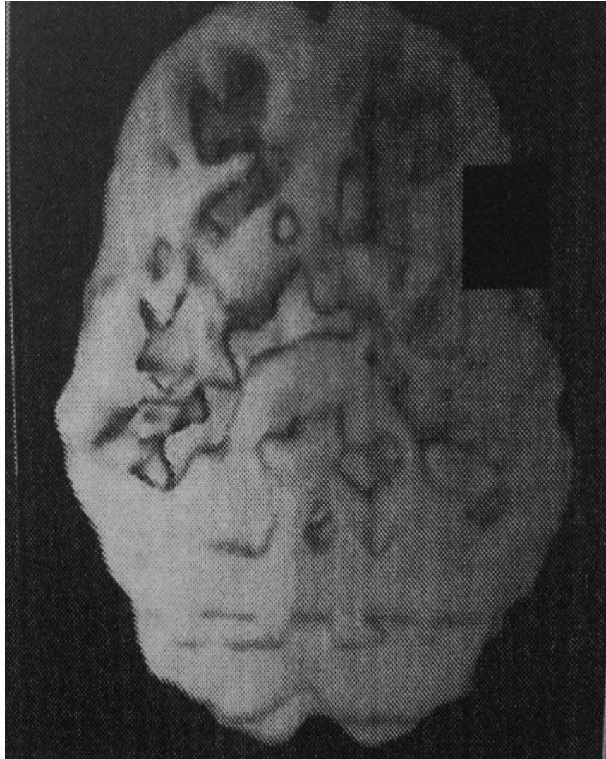
A SPECT image of a brain affected by cannabis use. “Holes” in the image indicate regions with low brain blood flow and cell activity.